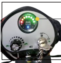
Fault display LED

The controller contains the procedure of identifying the trouble spot and trouble clearing. when the errors and problems are detected by the diagnostic program, the LED on the control panel will shine and the fault warning buzzer will alarm at the same time. The fault display LED will keep flashing in form of fault indication code 1 until fault exclusion. For example: fault code "2-9", the user can try to solve the problem according to the following methods , if the problem persists, please consult that with us or our agent .