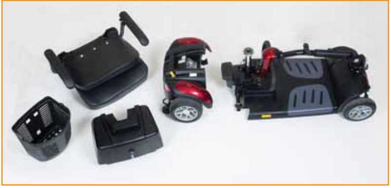
Disassembles into 5 pieces!