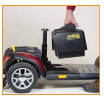
Step 2: Pull out the battery pack!