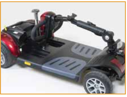
Step 3: Fold down tiller and lock in place!