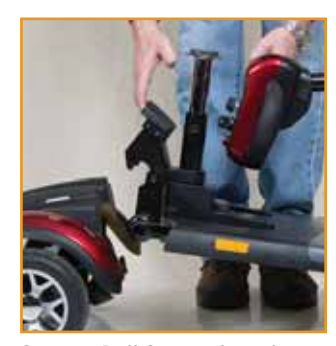
Step 4: Pull forward on the drivetrain release lever to separate the front and rear frame sections!