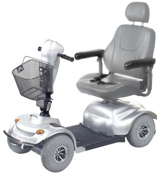
Model GA 541