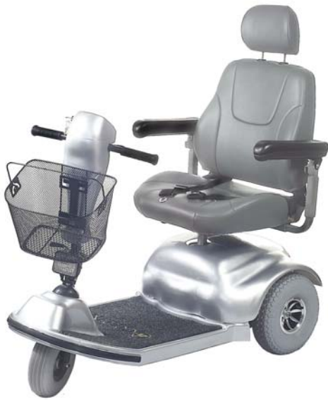
Model GA 531