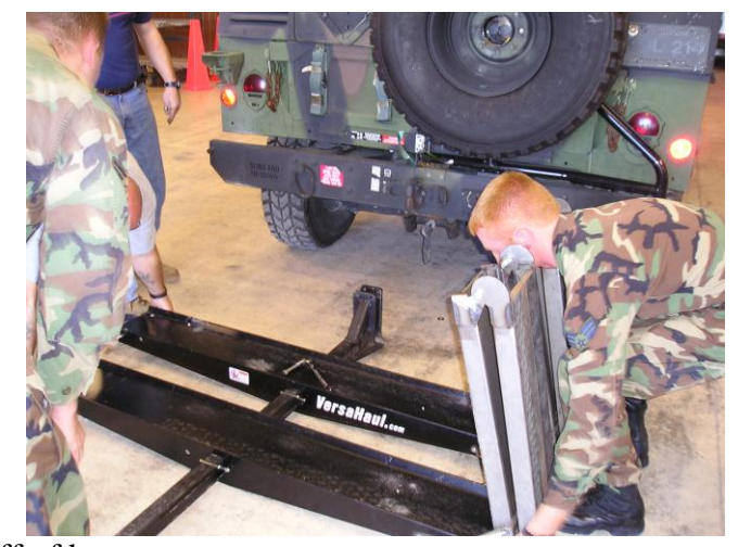
Remove transporter by removing tube bolts and sliding off of bumper.