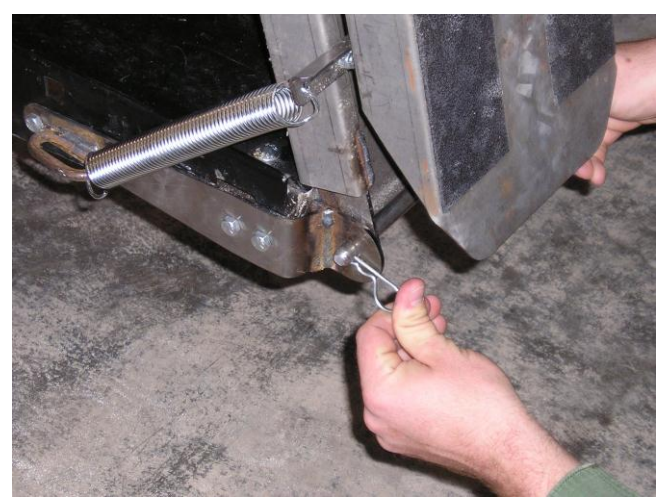
Remove hinge pin from platform and insert hinge pin between platform and ramp and secure with retainer clip.