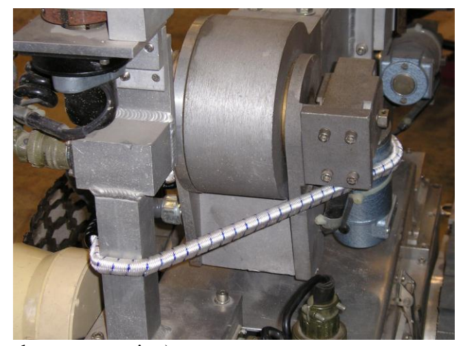
Secure arm with bungee cord (helps reduce damage to arm when transporting).