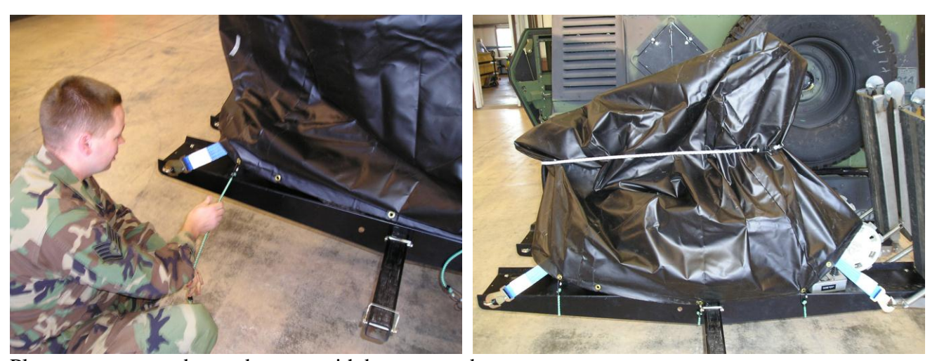
Place cover over robot and secure with bungee cords.