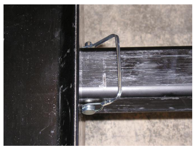
Slide the first platform all the way on the tube (make sure ramp is on the passenger side). Insert safety retainer pin in hole nearest bumper.

Slide platform back so it just hits the safety retainer pin.