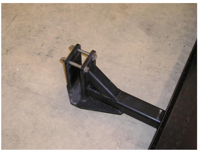
Reinstall tube bolts so they don't get lost.