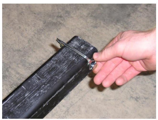
Insert safety retainer pin in hole at the end of the tube (This will keep the platforms from sliding off if the bolts should become lose).

Tighten the 4 bolts under the platform that secure the platform to the tube (9/16" wrench needed).