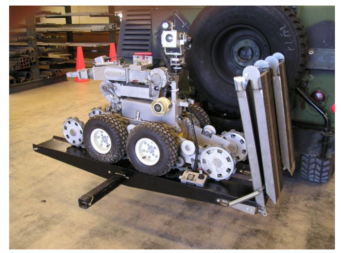
Center MARK VI on tube and fold ramps to travel position.