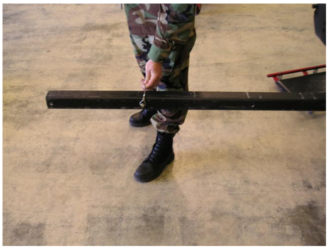
Remove safety retainer pins (3 places).