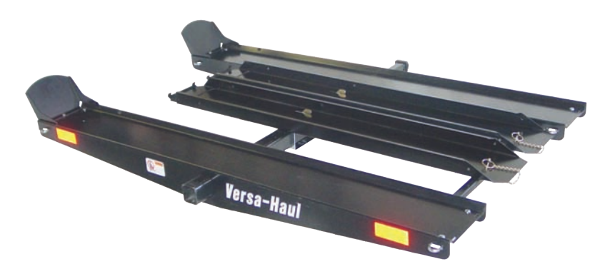
Assembled VH-90 carrier with VH-90 RK

Insert the Main Tube into the second Main Rail. Insert the Ramp Bar into the upside-down U-shaped hole on the second Main Rail. Measure the wheel base of your ATV or go-kart and maneuver the rails to fit the wheel base. Tighten the 36" Bolts on bottom side of the Main Rails to lock them into place (but DO NOT over-tighten).