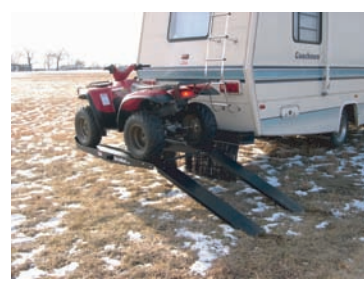
VH-90 with VH-90 RK in use