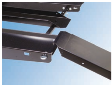
Attaching the Ramp.

Take the Lynch Pin and Chain and insert the cotter pin into the side holes of the Ramp Bar. Spread the ends of the cotter pins to keep the pins secured to the Ramp Bar. Note: The Lynch Pins do not snap onto the Ramp Bar until the Ramp is in place.