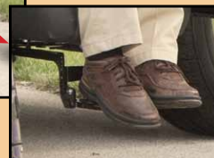
Shown with optional footrest

Bruno also offers the Turny , a rotating/lowering seat to assist individuals who have difficulty transferring in and out of higher vehicles. (shown above)