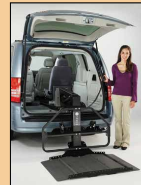
JOEY™ VEHICLE LIFT