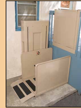
VERTICAL PLATFORM LIFT