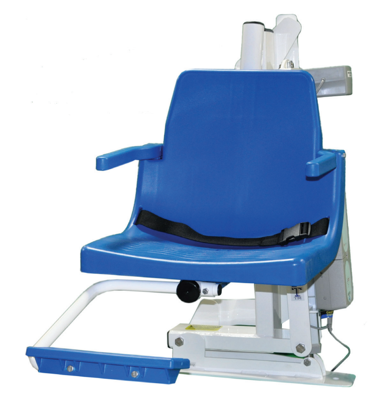
Global Lift Corp. Products are Laboratory tested to meet ADA Standards

The new Superior Series SXR Extended Reach Lift is specifically designed for spas and pools requiring additional reach and is capable of clearing benches or gutters up to 20" wide.