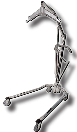
Item # 13023