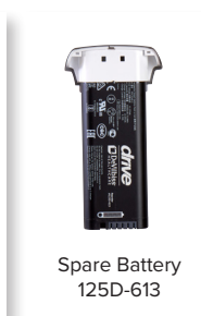
Spare Battery 125D-613