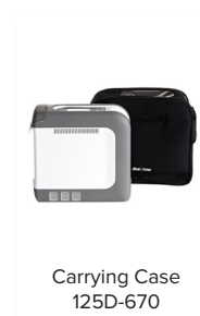
Carrying Case 125D-670