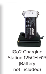
iGo2 Charging Station 125CH-613 (Battery not included)