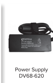
Power Supply DV68-620