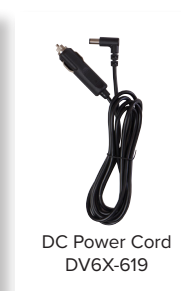
DC Power Cord DV6X-619