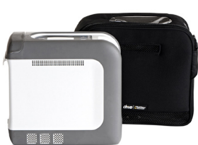
Carrying Case 125D-670