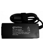
Power Supply DV8-620 (Power cord sold separately)