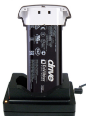
iGo2 Charging Station 125CH-613 (Battery not included)