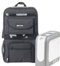
iGo2 POC Backpack 125D-674