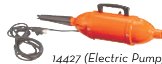
14427 (Electric Pump)