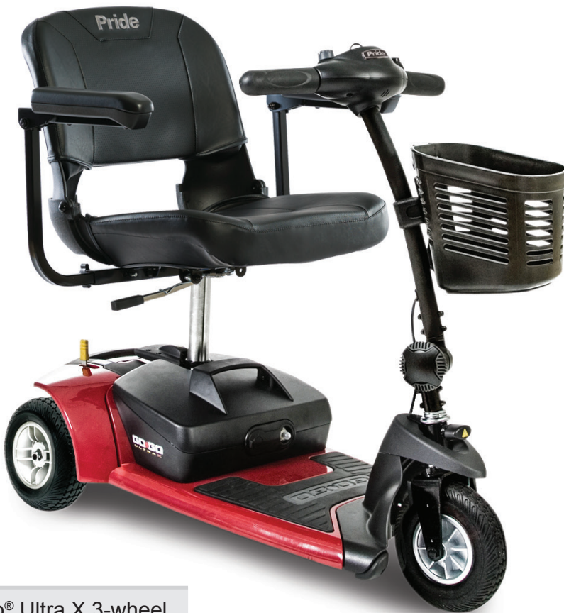
Go-Go® Ultra X 3-wheel

The Go-Go® Ultra X is loaded with features such as one-hand disassembly and a convenient drop-in battery box for worry-free travel. With a 300 lb. weight capacity, a maximum speed up to 4 mph, a per-charge range up to 10.4 miles on the 3-wheel and 13 miles on the 4-wheel, Go-Go® Ultra X is an exceptional value.