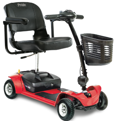
Go-Go® Ultra X 4-wheel