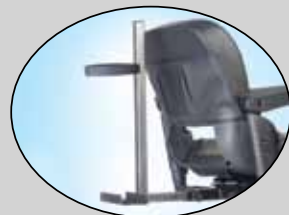
Quad Cane Holder