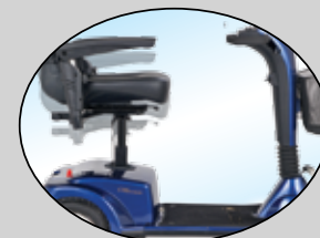
Power Elevating Seat