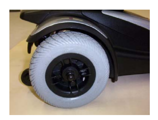
Rear Tire Solid/Foam-filled