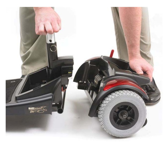
"Push" the rear down to separate connections and front from rear.

<u>Step 7</u> - Hold seat post with one hand and push the rear section apart as shown below to disconnect the front and rear frame sections.