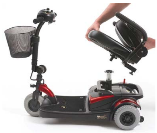
"Pop" the seat.

<u>Step 3</u> - While holding the seat rotation lever up, grip the seat and remove from the scooter – Your seat will pull out of the post. Grip the seat on opposite sides and, with a firm grip, pull the seat straight up towards you to remove.