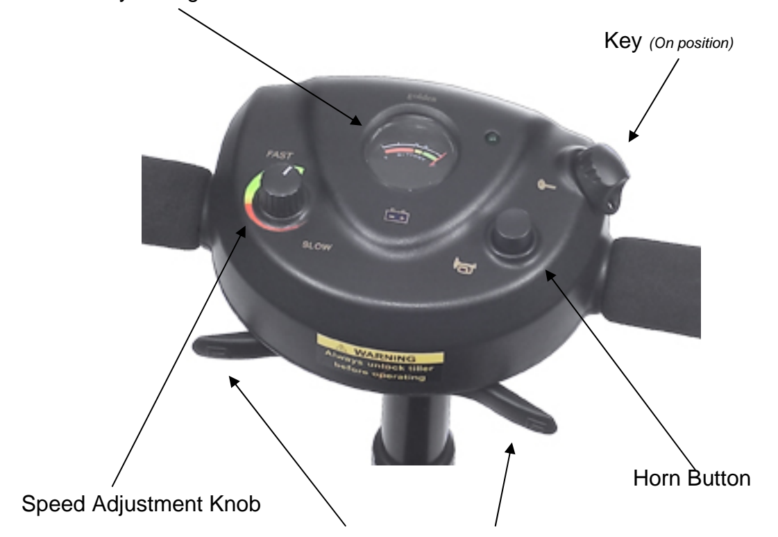
(Reverse) Drive Control Lever (Forward)