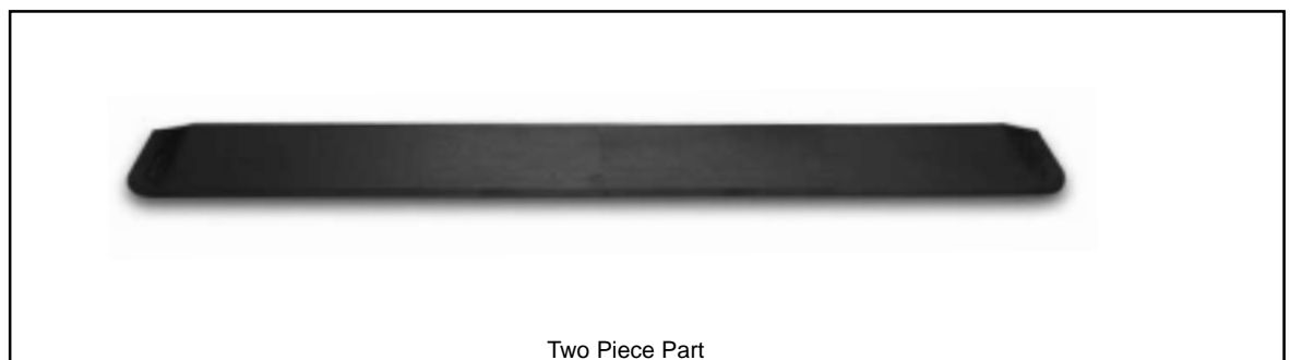
Two Piece Part