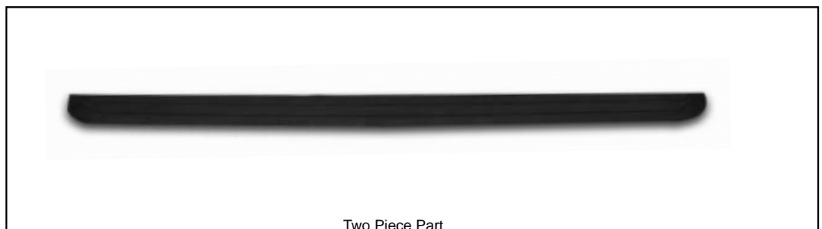
Two Piece Part