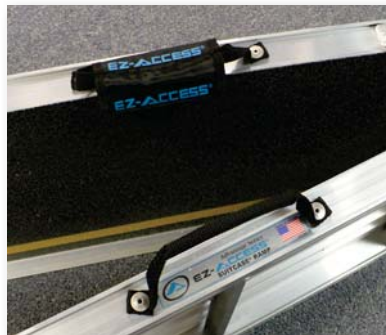
Ergonomically designed flexible, non-breakable handles offer convenient carrying and a comfortable grip