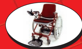
Manual Wheels (Accessory Option)