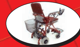
Basket (Accessory Option)