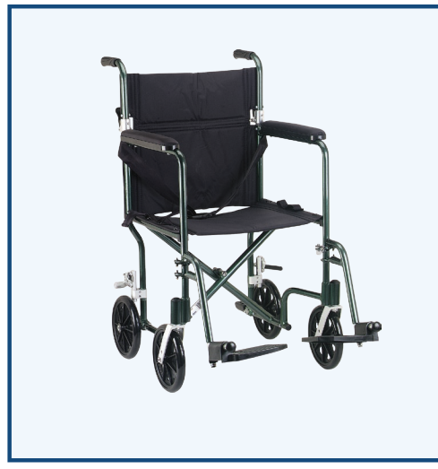
Item # FW19GR Shown

It is important for the attendant to be familiar with proper assisting procedures in any situation that requires the use of the Transport Chair. Safety is the Key consideration. Consult your physician, nurse of physical therapist to determine methods most suitable for your individual needs and abilities.