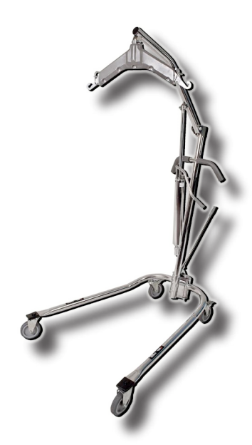
Item # 13023