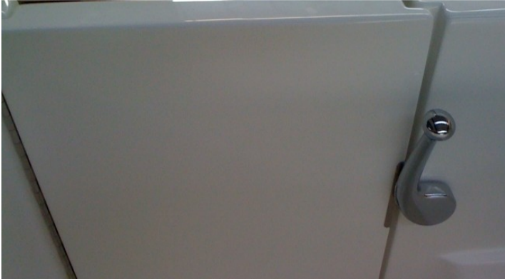
Roman Door Handle

1. Enter the Elite walk in tub then close the door and seal it by pulling the handle toward you, into the locked position. Below are the pictures of the Elite 2653, 3053, 3555, 2848 walk in tub handle.