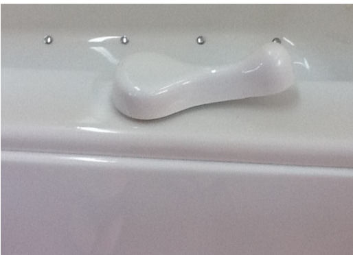
Quick Twist Handle ** Elite 3137 & Lay Down Tub ** While sitting in the tub turn the handle to the right to interlock the door.