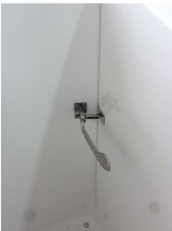
Space Saver Handle ** Elite 2645 Walk in Tub ** Fold the Elite 2645 Walk in Tub door and then lock the space saver handle towards the walk in tub door.