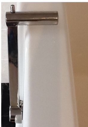
Interlocking Handle ** Elite WC3052 Walk in Tub ** Push the handle forward while pushing the pin down while the Wheelchair Accessible Tub interlocks securely.