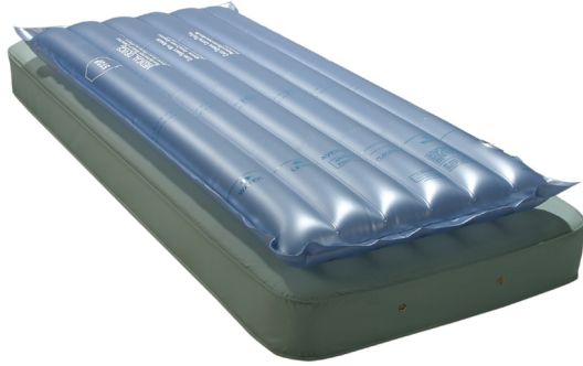
REF. 14400 shown