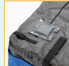
Auto Boost Sensor Pad

3 DIFFERENTIAL PRESSURE ZONES FOR HEAD, BODY AND FOOT SECTIONS TO PROVIDE CUSTOMIZED PRESSURE REDISTRIBUTION.