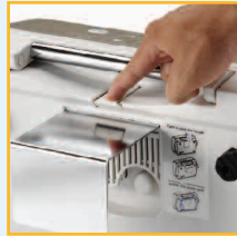
Heavy Duty Versatile Hanger